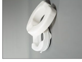
Toilet Seat Riser