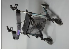
Four wheeled walker