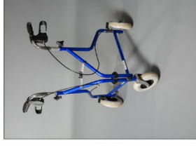
Three wheeled walker