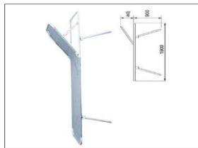
Changing Stretcher Bathroom of Bench Cottage only.