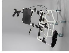
Tilt 'n' space Showerchair