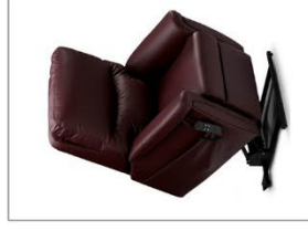
Riser Recliner Chair

Essential equipment for your holiday cottage can be provided, on a first reserved basis at www.ourbench.co.uk if you book with us!