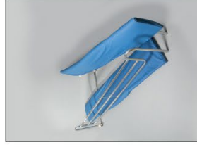
Netting for Bed Rails