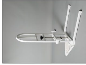
Parnell Bed Rail