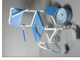
Carers Shower Chair