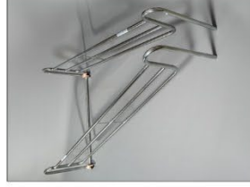
Optional Bed Rail