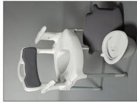
Commode / Raised Toilet Frame