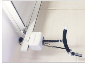
H-Hoist (Bench Cottage Bathroom Only)